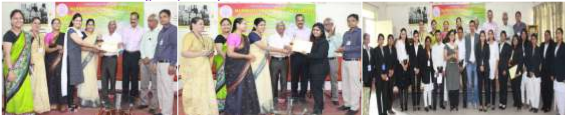
MPLC -VI National Power Point Presentation Contest -2017