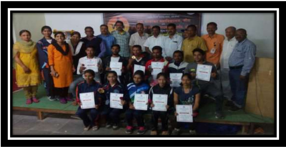
Figure 8 winner Yoga team