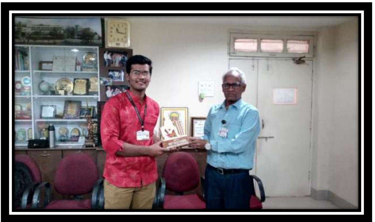
Figure 12 Cricket Dist Level