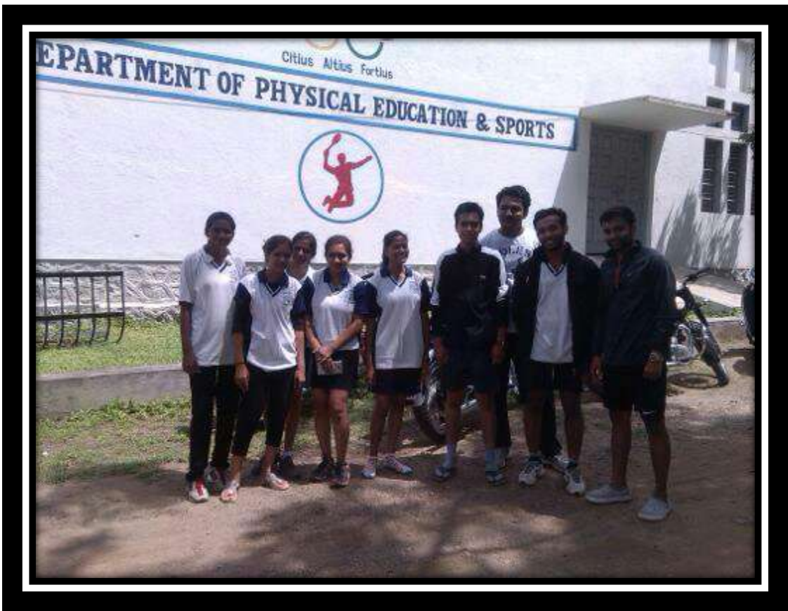
Figure 4 Badminton Bronze Medal