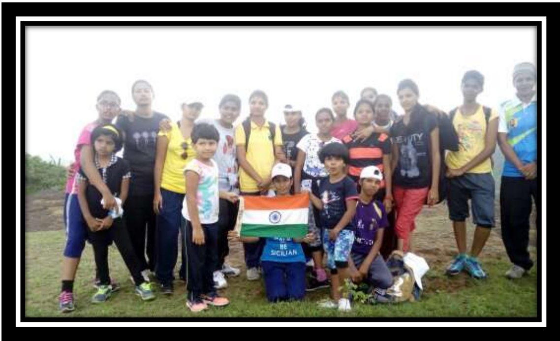
Figure 1 Trekking