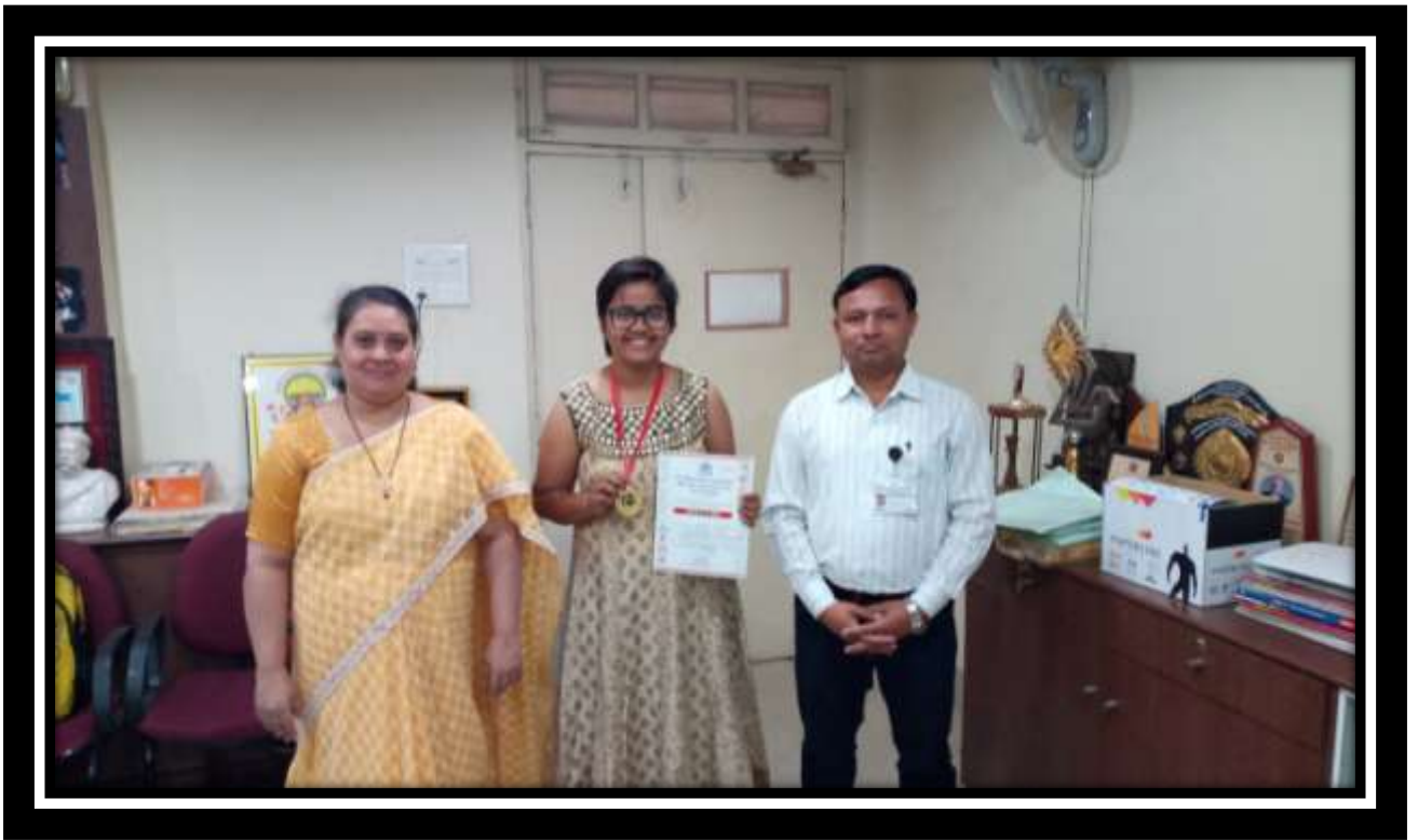
Figure 10 Winner taekwondo