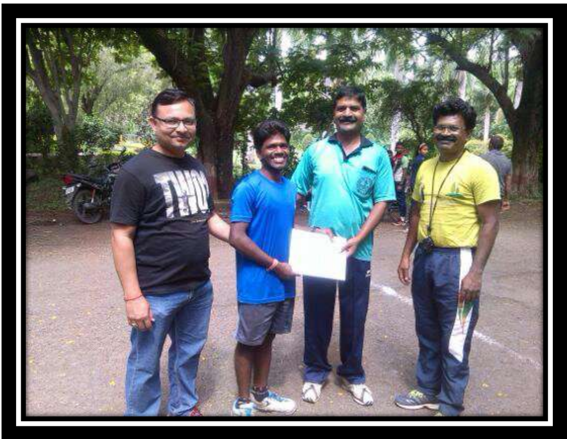
Figure 5 Cross Country Dist Level