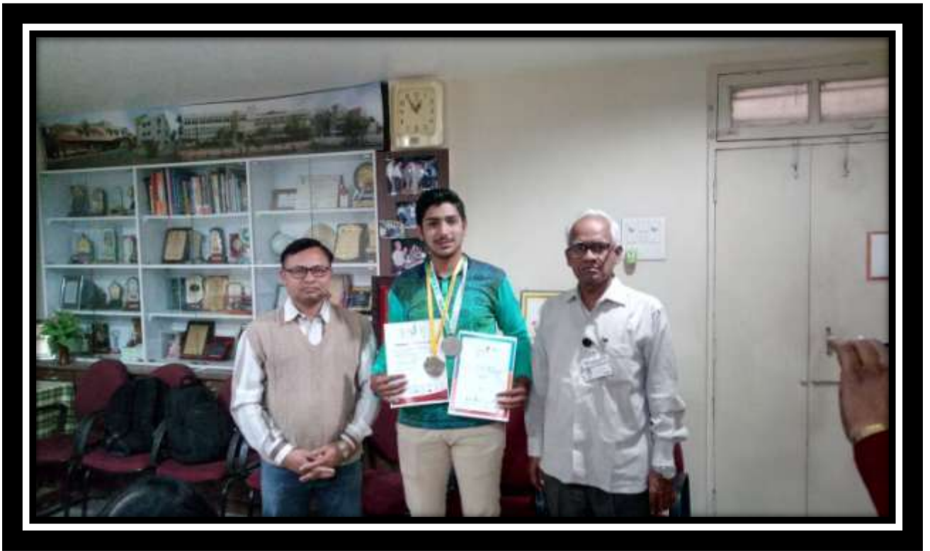
Figure 11 Long Dist. Runner