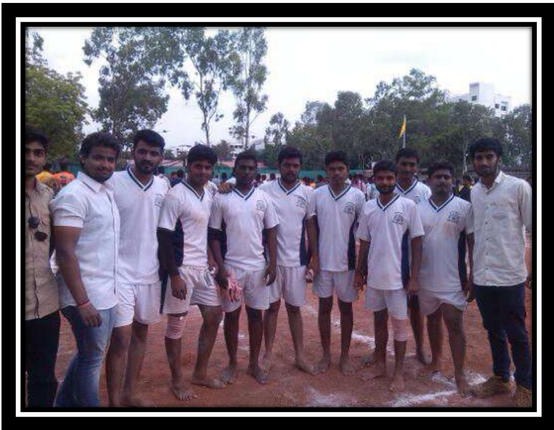
Figure 2 Kabaddi Team