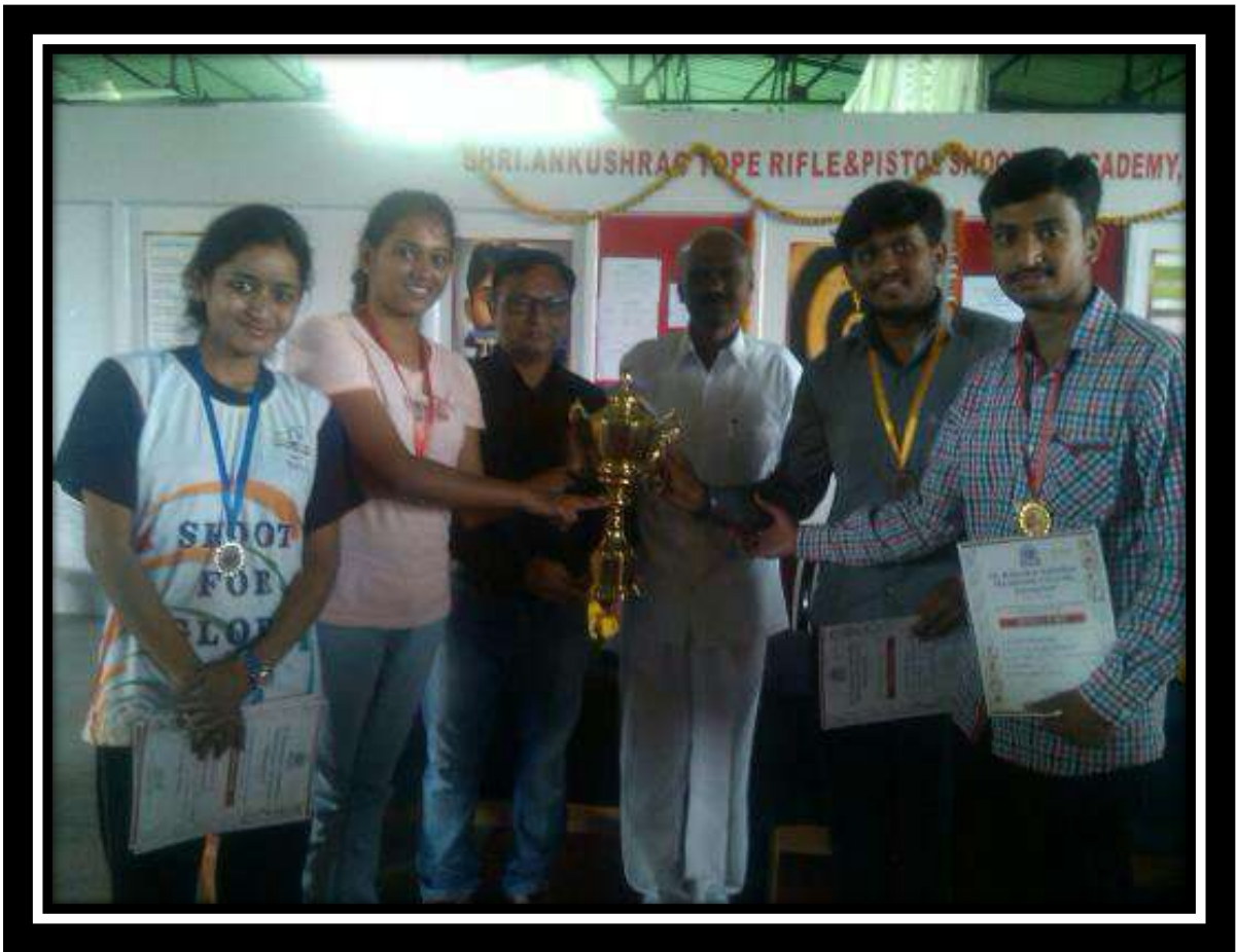
Figure 7 Winner Team of Shooting