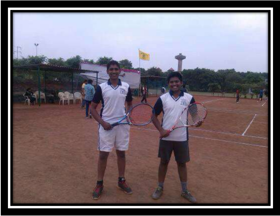
Figure 6 Lawn Tennis Team