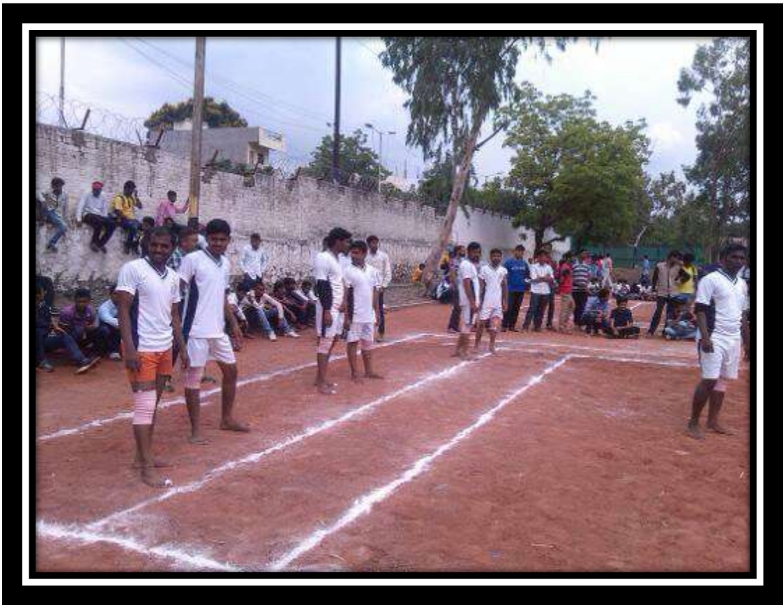
Figure 3 Kabaddi Match