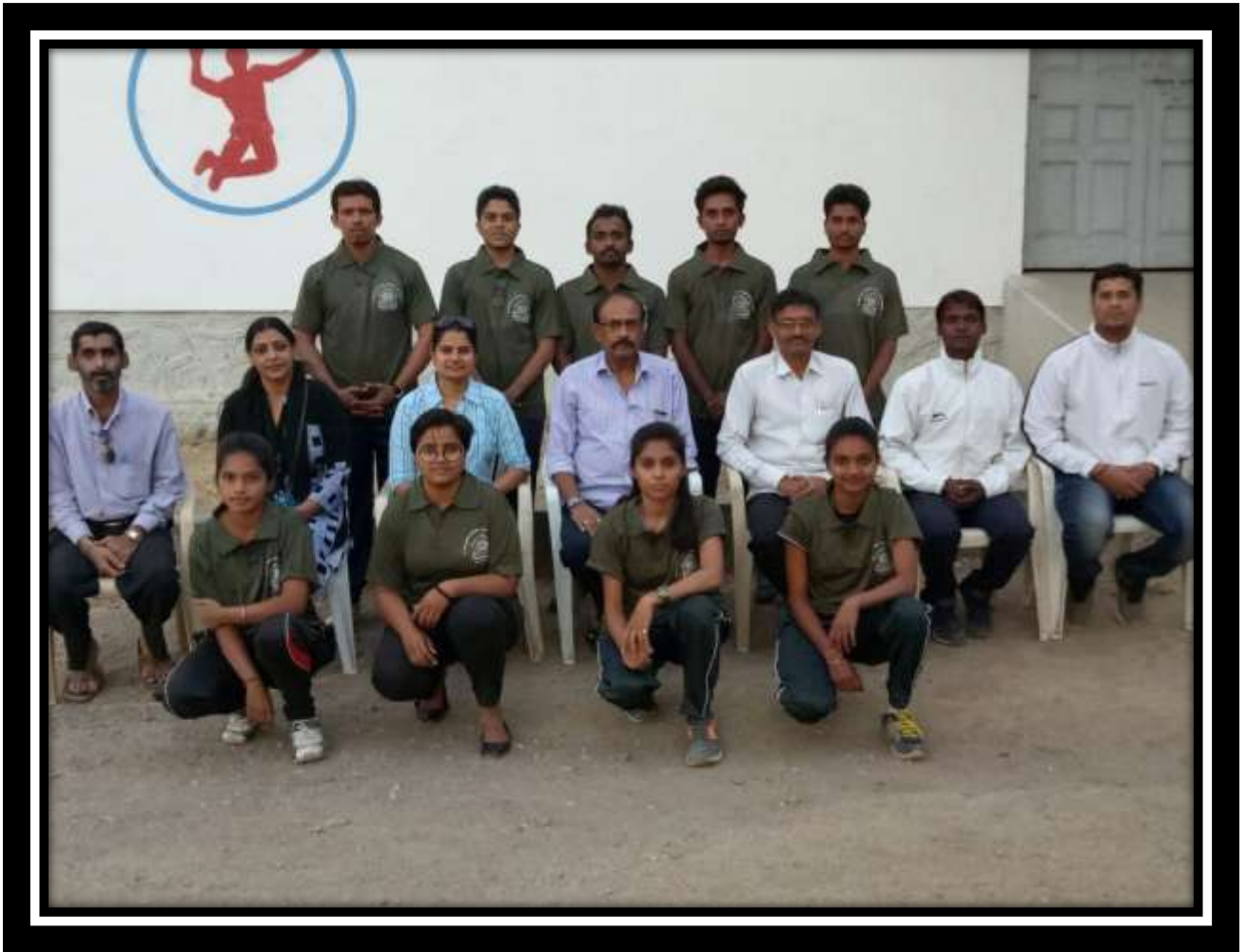
Figure 13 IUT Team of Taekwondo