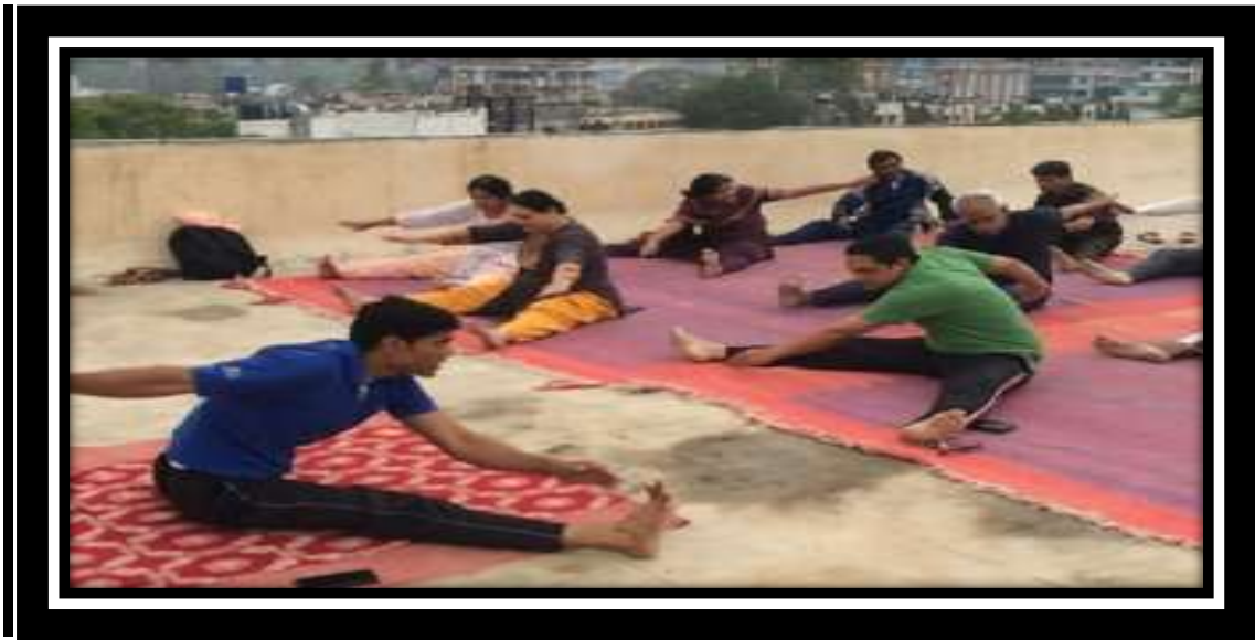
Figure 14 Inter National Yoga Day