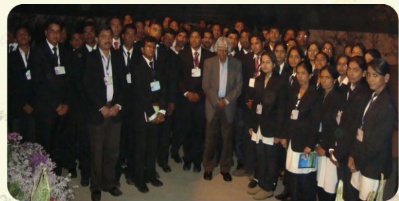
Final year students with Honorable Dr. A.P.J.Abdulkalam